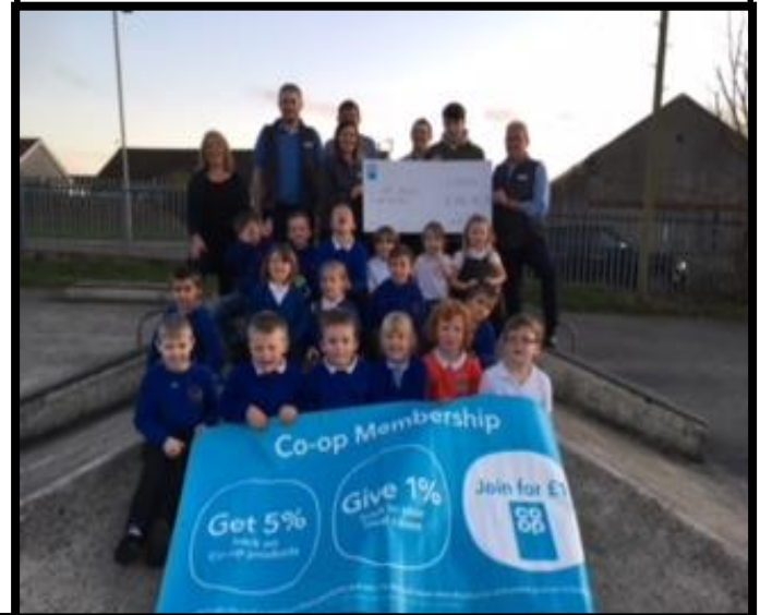
Big thanks to Cooperative Stores in Porthcawl for the fantastic Community Fund donation!