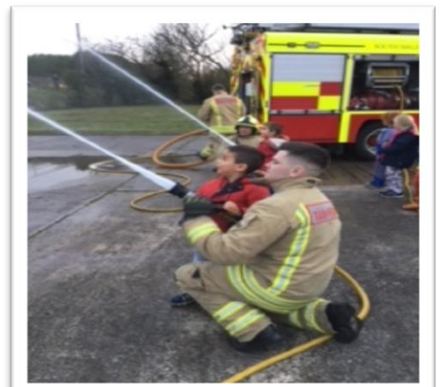
Top & Middle: Sumo Fun at Marlas! Bottom: After School Club with our local Fire Service!