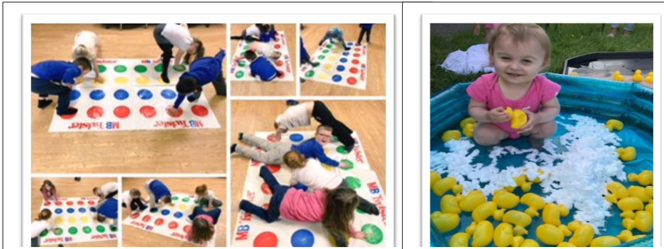
After School Fun for our 5-7s, and having fun at our Messy Play Sessions!