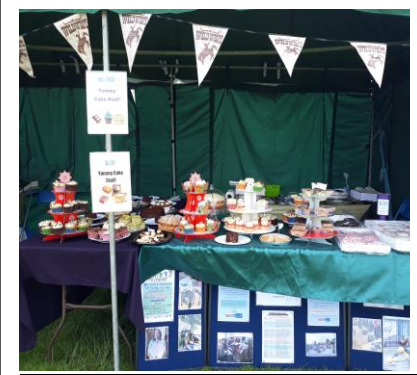
Our “Yummy Cake Stall” at Pyle Festival Day!